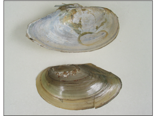
Anodonta oregonensis (Oregon Floater)